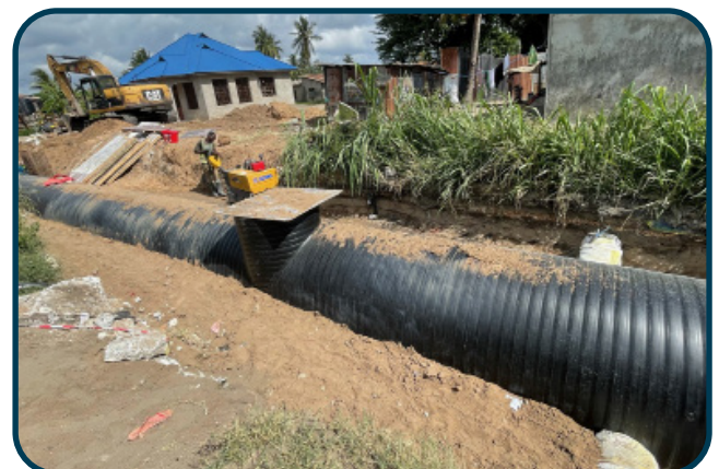
DMDP Temeke Drainage Project