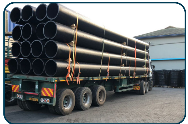
Weholite Pipes ready for Delivery